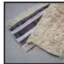
ACH Style - Cotton Disposable