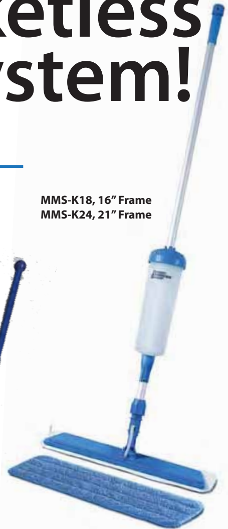
Standard MMS Microfiber Pad