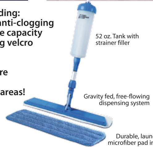
52 oz. Tank with strainer filler

See our catalog for a complete line of microfiber damp-mops for the Bucketless System, or contact your Tuway Representative.